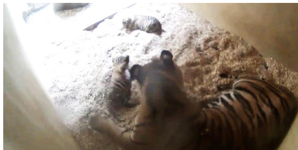
Pictured: Sumatran tiger, Kasarna and her cubs

Do you know any interesting tiger trivia?