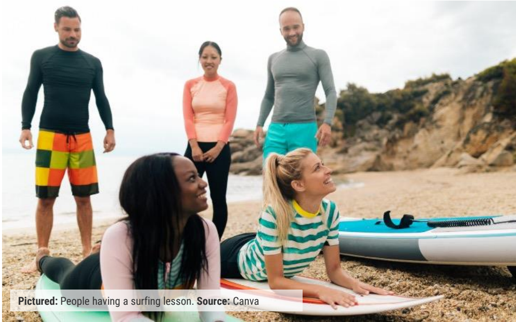
Pictured: People having a surfing lesson.