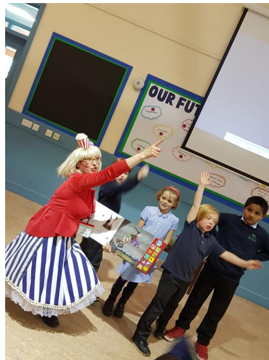
Movie & Disco Nights